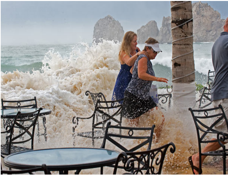
People flee the deck of a hotel in Cabo San Lucas, Mexico as large waves from Hurricane Rick overtake their perch.