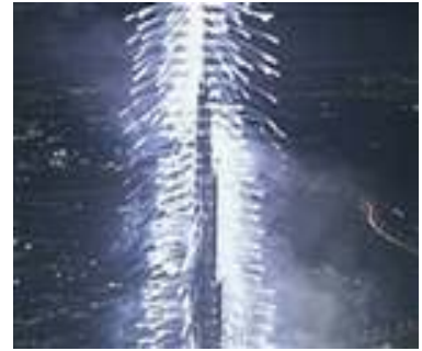
The grand opening included fireworks shooting out from every part of the building!