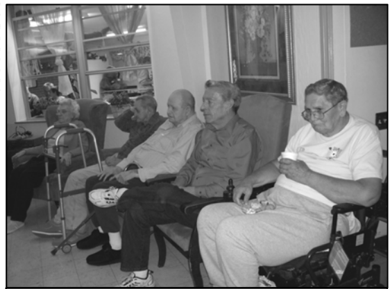
Waiting for the party to start!