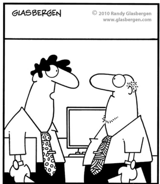
"I predict nothing but continued growth and expansion for the rest of the year. But enough about my diet..."