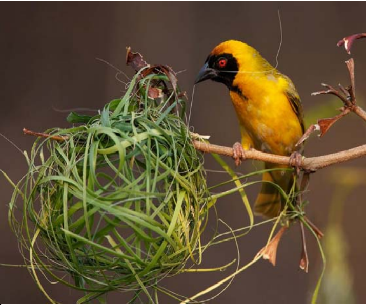
Southern Masked Weaver This photographer had a priceless opportunity to watch these amazing builders constructing their homes from the very beginning till the end, from the first framework made of a few grass leaves till the very last stalk had been implemented and all the salient parts smoothed to satisfy the female. (See the thin blade of grass in her beak?)

MONDAY, JANUARY 3 RD 9:30 PRETTY NAILS 10:00 DEVOTIONAL -TIM TURPIN 4:00 CURRENT EVENTS 6:00 DOMINOES